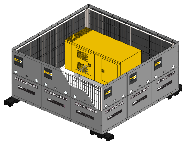
Acoustic Sound Reduction Quilt supported by temporary fencing system around generator

Noise Reduction Barriers work by absorbing sound energy, thus reducing the perceived noise level (dBA). For instance, a flat saw engaged in concrete produces the noise output equivalent to a jet flyover at 1,000 feet. Our barriers reduce the perception of the sound of a flat saw engaged in cutting a concrete slab by nearly half, to a similar experience of standing near a gas-powered lawn mower.