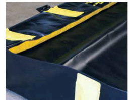
Fail-Safe® flotation device on both the entry and exit walls is self-erecting and will rise as the fluid level rises. The entry/exit walls also have the brace support, which will lock into position with the rising fluid level.