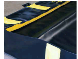
Fail-Safe® flotation device on both the entry and exit walls is self-erecting and will rise as the fluid level rises. The entry/exit walls also have the brace support, which will lock into position with the rising fluid level.