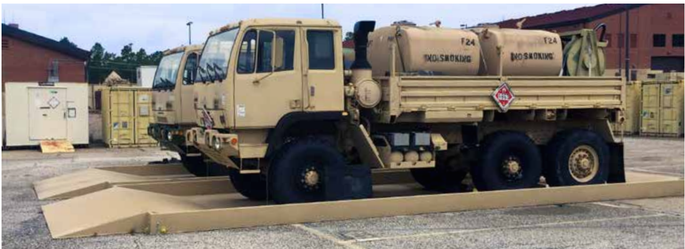
Contains fuel trucks as well as fuel pods.