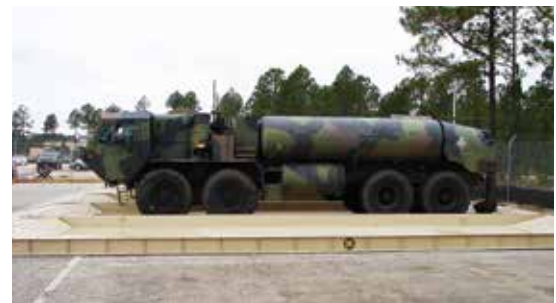
Innovative design requires no assembly during setup and no disassembly to relocate.

The fully tested, innovative design eliminates the risk of gasket failures and allows you to relocate or reposition the unit without disassembly. Optional integrated ramps allow you to customize the unit to your needs.